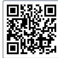
Mappyfield365 on MS Appsource