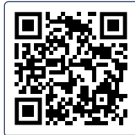
Calendar365 on MS Appsource