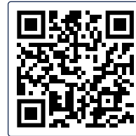
Customer Portal for Dynamics 365 by CRMJetty